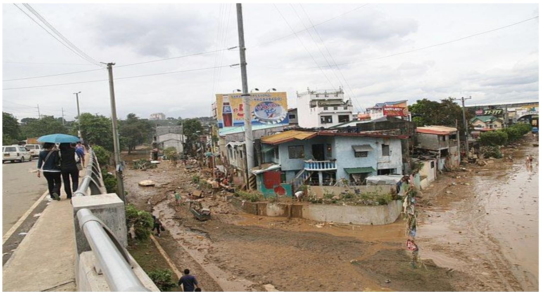
Marikina Riverbanks and Urban Bliss Community after Ketsana, 2009