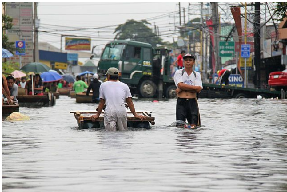
During onslaught of typhoon Ketsana (Ondoy), 2009