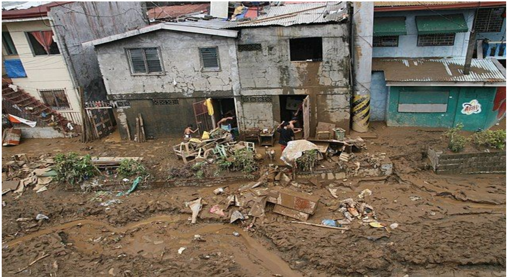
Aftermath of Typhoon Ketsana (Ondoy) 2009, Photos from Wikimedia Commons